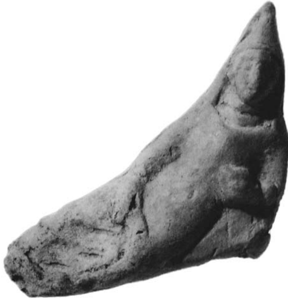
Figure 10 Type 4 reclining female figurine, front view. Double moulded. Height: 10 cm. Museum location and number: British Museum, BM 68-6-2-8.

features of this particular figurine shed light upon specifics of this process of cross-cultural interaction. The first of these is the exaggeration of certain anatomical characteristics, namely the navel and the contrast between the wide hips and the very narrow waist. These particular types of anatomical exaggerations are not common to either pre-Hellenistic Greek or Babylonian figurines. The second feature, a three-knobbed triangular headdress, is also lacking a pre-Hellenistic precedent – indeed, this style is known only in Hellenistic figurines from Babylon and Seleucia (Karvonen-Kannas 1995, 124). Both of these characteristics of Figurine 5 represent local inventions. Thus, regardless of the Greek or Babylonian cultural heritage of the individual who made and used this figurine, he or she was clearly participating in more than just a personal choice of functional and aesthetic preferences – this individual was also engaged in the process of creating a new, multicultural tradition and material culture.