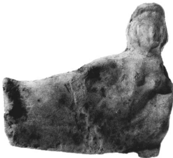
Figure 9 Type 4 reclining female figurine, front view. Double moulded. Height: 10.5 cm. Museum location and number: British Museum, BM 76-11-17-2399=91784.

a figurine function (such as presenting offerings to a household deity) than the Babylonian type previously used. Thus, the Babylonian individual was enabled through these cross-cultural combinations of figurine stylistic features to retain the elements of his or her personal religious practice and cultural figurine traditions, such as the emphasis on female sexuality, which he or she found most important. Simultaneously, he or she was able, through personal interactions with Greek people, to learn about Greek figurine meanings, relate these meanings and functions to his or her own traditions, and then adopt aspects of Greek figurine styles which he or she found pleasing, interesting, or beneficial.